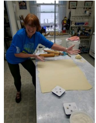
Making Christmas Prune Tarts!